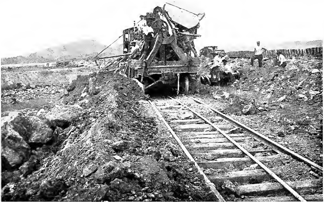
1. Side view of dirt spreaders at work on the dumps. 2. Front view of same.