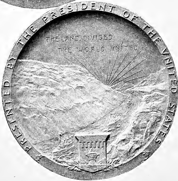
Medal of honor presented to canal employees who gave two years' continuous service.